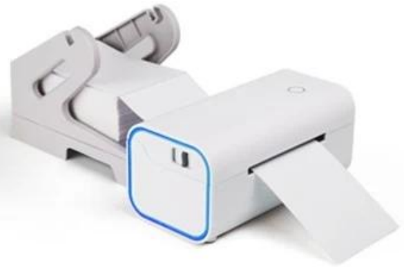
Print stacked labels