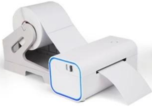
Print roll label